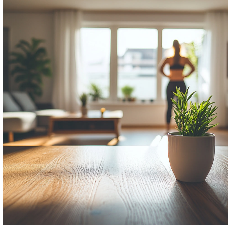
For the home