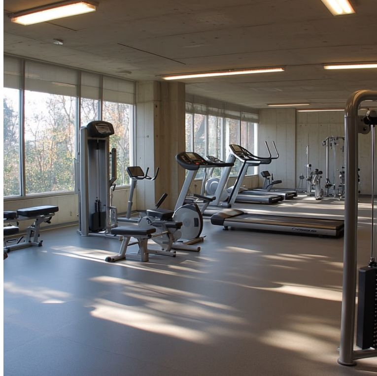
For Fitness Centers